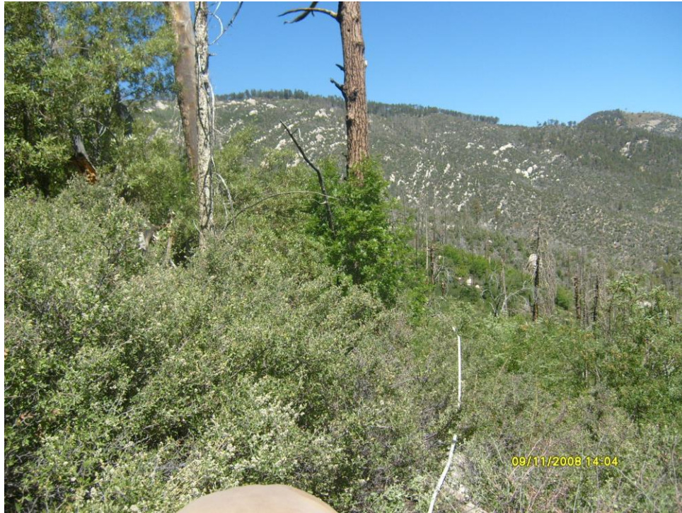
Figure 4 20

Incipient biome shift in the Santa Catalina Mountains, Arizona, following the 2002–2003 Bullock and Aspen Fires. Areas previously dominated by pine and dry mixed-conifer forest have transitioned to grass- and shrub-dominated communities as well as early seral forest types.