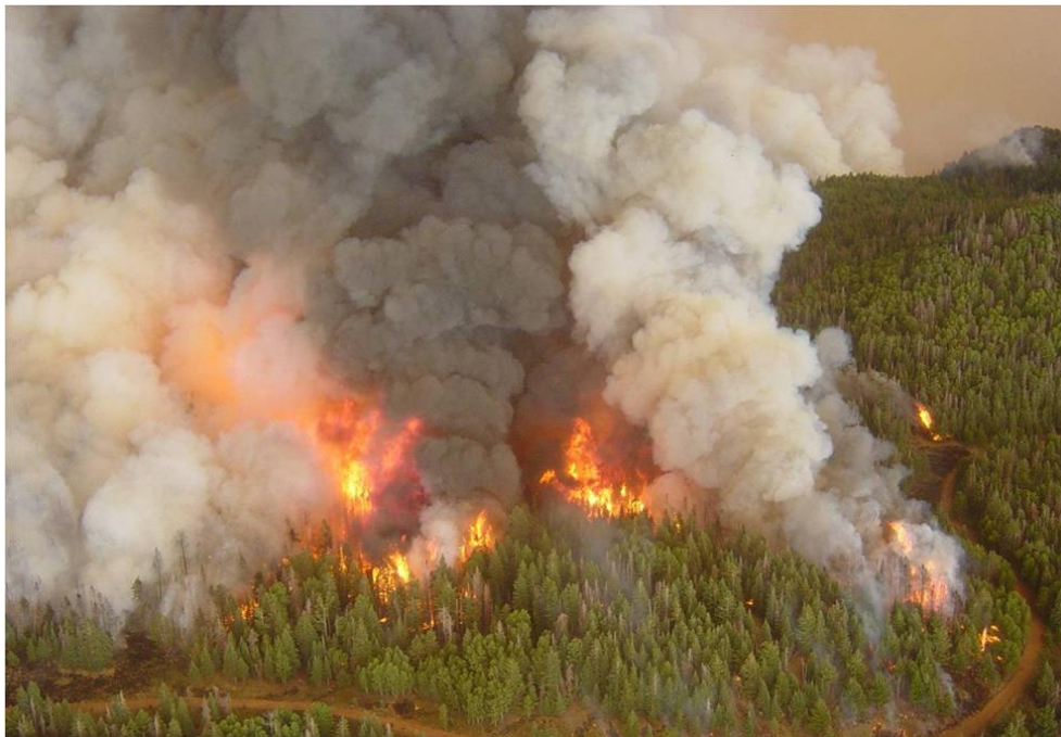
Figure 1 13

Large, severe wildfires are increasingly common in Southwestern forests, including the Sky Islands and Mogollon Rim bioregions. The 2006 Nutall-Gibson Fire in the Pinaleno Mountains burned extensively through ponderosa and mixed-conifer forests as well as higher-elevation spruce fir.